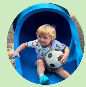
Wonder, Imagination & Play and Campfire & Community provided new opportunities for families to connect this summer.