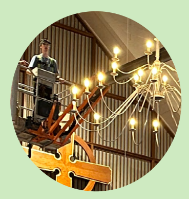
Installed energy-efficient LED lighting in all areas of the church building, expanding our efforts as an Earth Care Congregation.