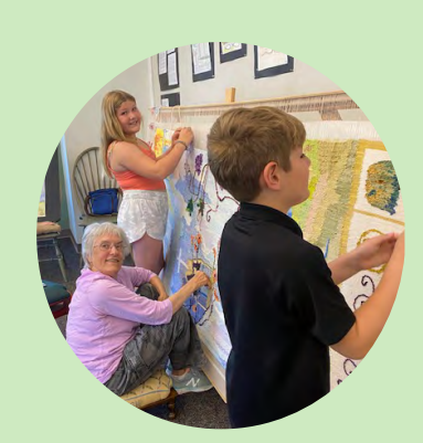
The new Westminster Tapestry, a 5-year project supported by the Westminster Endowment and numerous volunteers, was dedicated in February.