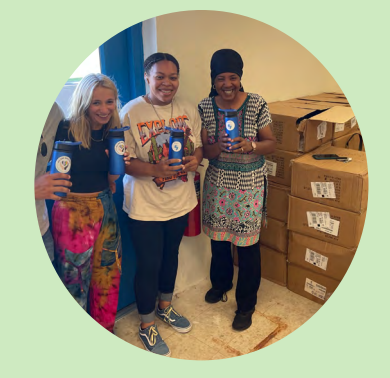
A new partnership with Cheyney University supports first-generation and under-resourced college students: WPC donated 750 water bottles filled with supplies to welcome students back to campus.