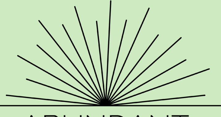
ABUNDANT life Westminster Presbyterian Church