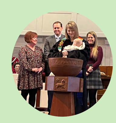
Welcomed 48 new members, celebrated 23 baptisms and made 400+ pastoral visits over the past 12 months.