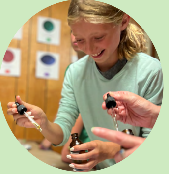
Expanding a partnership with Educational Equity Alliance: WPC youth participated in their Soap for Hope