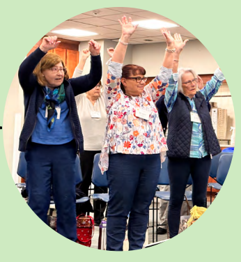
A spiritually uplifting women's retreat drew 66 participants.